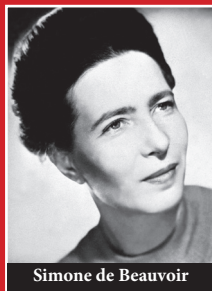
Simone de Beauvoir